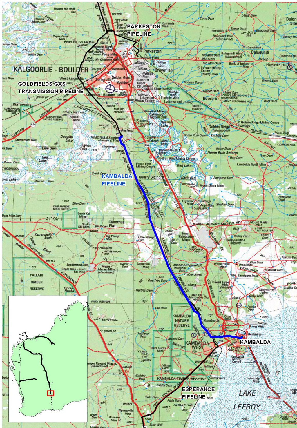
Map 2-1 - Location of the KKP

2.17 In its application, SCPA states that the KKP comprises of 44.3 km of 219 mm diameter pipeline and ancillary assets, and has an estimated total capacity of 26 TJ/day. There are currently two users of the KKP and three delivery points.