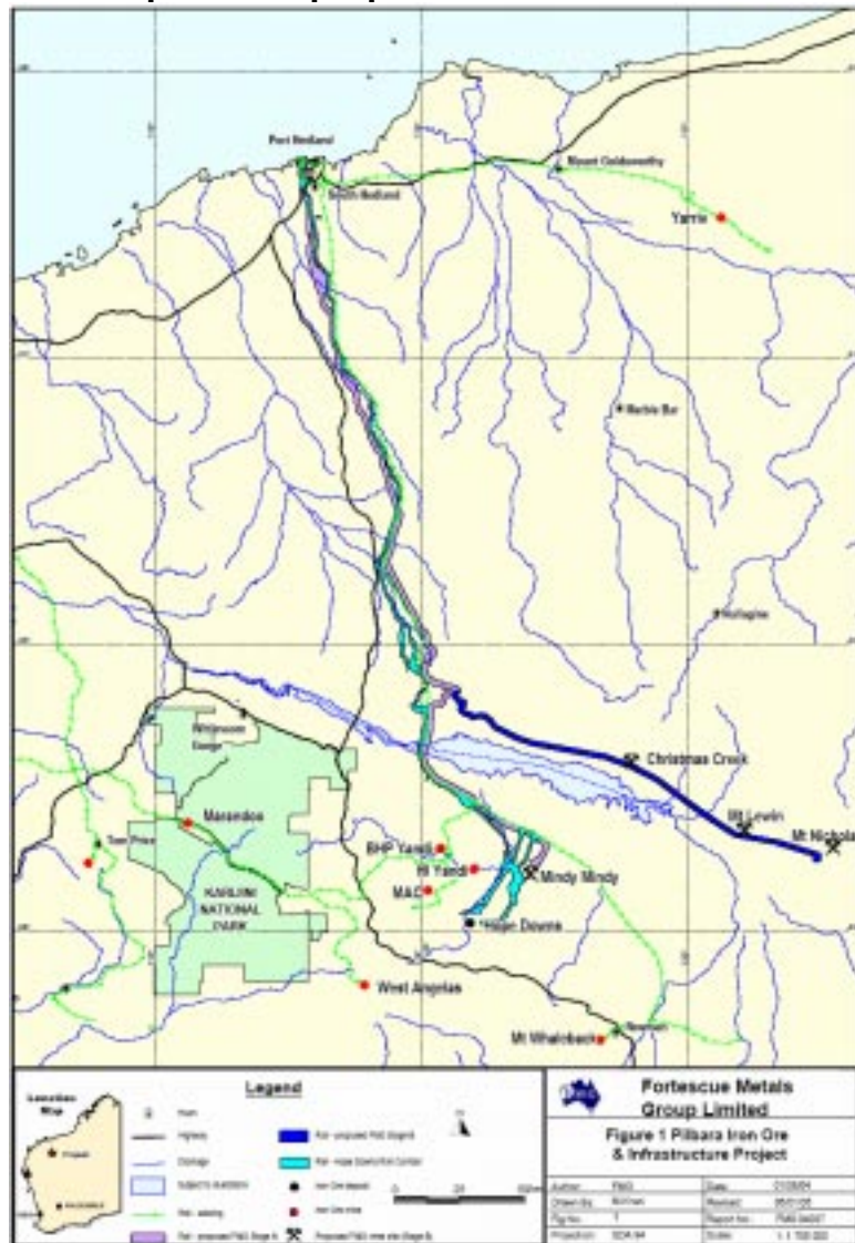
Source PER Figure 1